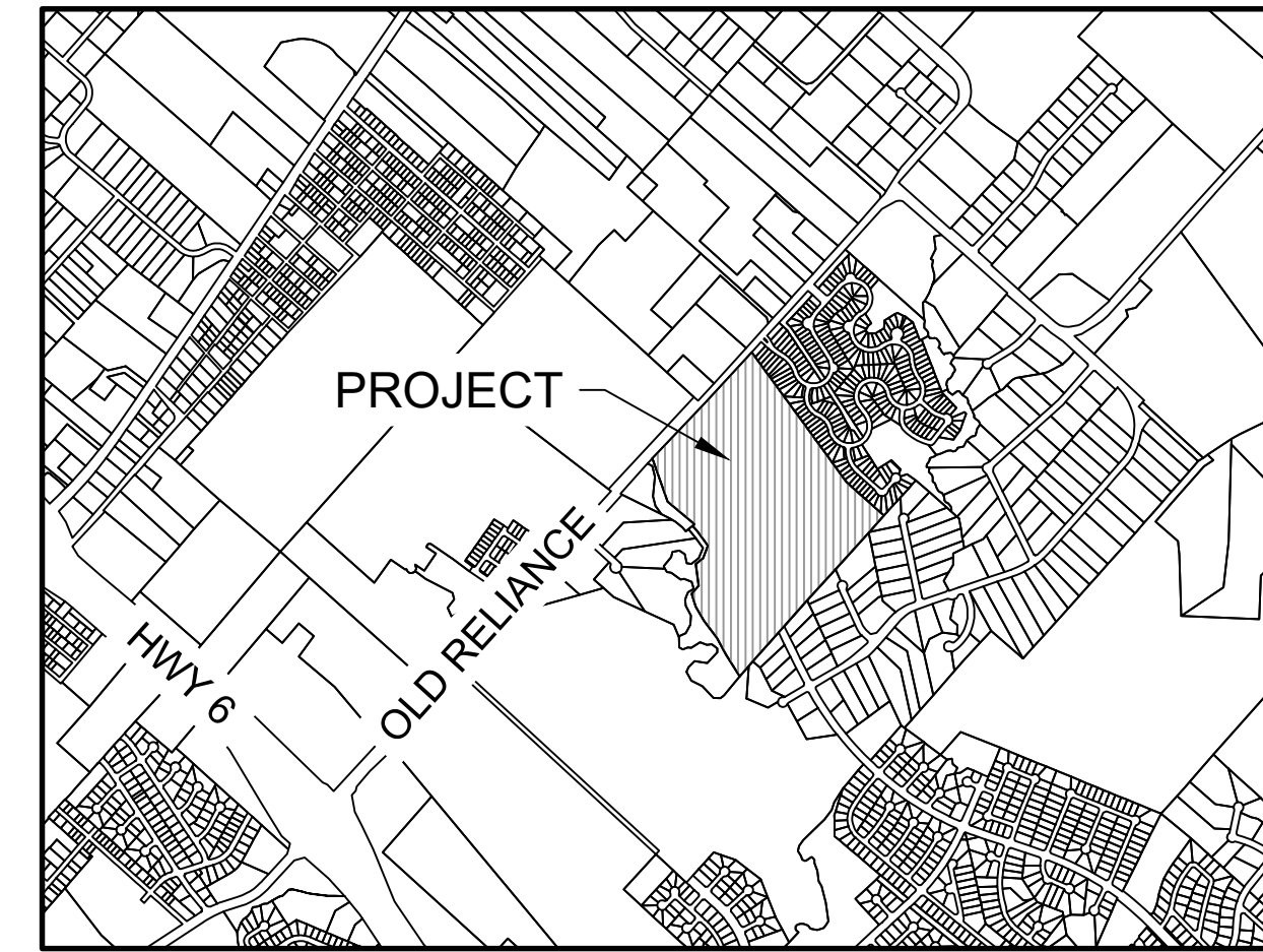
VICINITY MAP 1"=200'